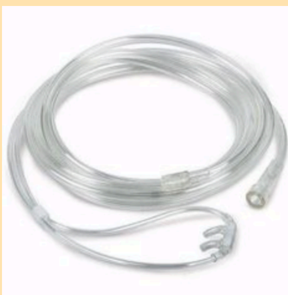
Low Flow Nasal Cannula